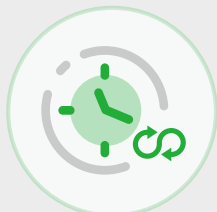
Long Cycle Life