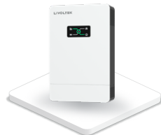
Off-grid Hybrid Inverter