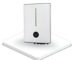
AC Coupled Inverter