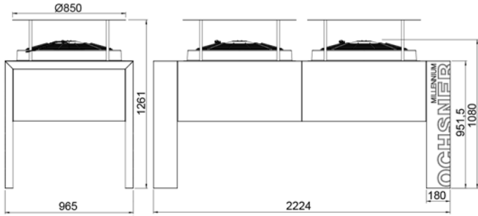
SPLIT EVAPORATOR VHS-M 80